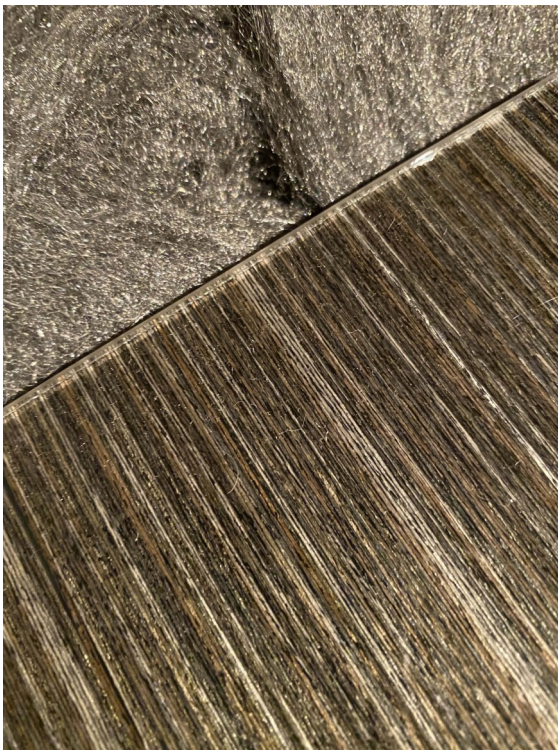
Our Steel Wool Composite in 1/4" Low Iron

In addition to the laminated glass, we can have Brogan Wood Products attach the glass to a more rigid substrate and provide it ready to install on standard Z clips by your millworker.